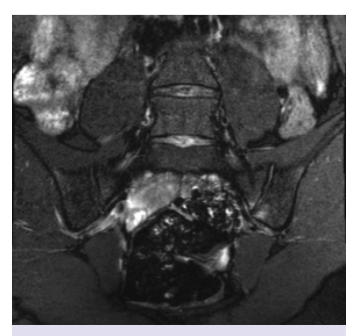
FIGURE 1. The magnetic resonance imaging shows bone marrow edema in the sacral and iliac wings of both the right and left sacroiliac joints.

herniation diagnosed. She underwent physical therapy for 15 sessions, although the pain continued. She then attended our outpatient clinic with the same complaints. On physical examination, lumbar flexion was restricted and painful with the sacroiliac stress test positive on the left side. The erythrocyte sedimentation rate (ESR) and C-reactive protein (CRP) were measured in the normal range, and the patient was HLA B27 positive. Magnetic resonance imaging (MRI) of the sacroiliac joint revealed that bone marrow edema was detected in the sacral and iliac wings of both the right and left sacroiliac joints, consistent with active sacroiliitis (Fig. 1). A dermatology consultation was requested and isotretinoin treatment was ended after the 4<sup>th</sup> month. Her complaints alleviated with nonsteroidal anti-inflammatory drug (NSAID) therapy after 2 weeks and her complaints resolved after 2 months.