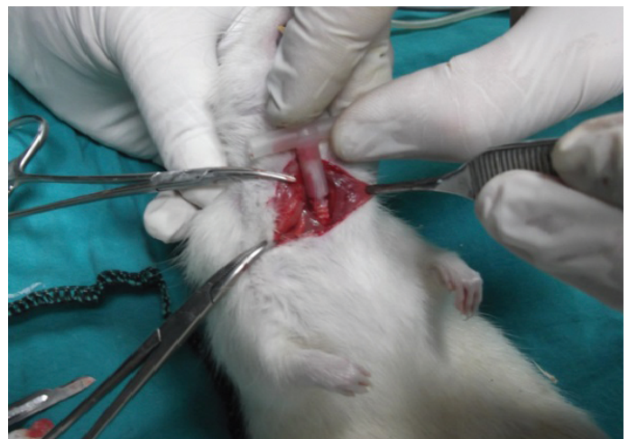
FIGURE 2. Tracheotomy cannula placement.

natal probe). At the moment when saturation decreased below 85% (hypoxia period), the measurements of distortion product otoacoustic emission were repeated. A single apnea was created that reduces oxygen saturation below 85%. Measurement was taken immediately after apnea.