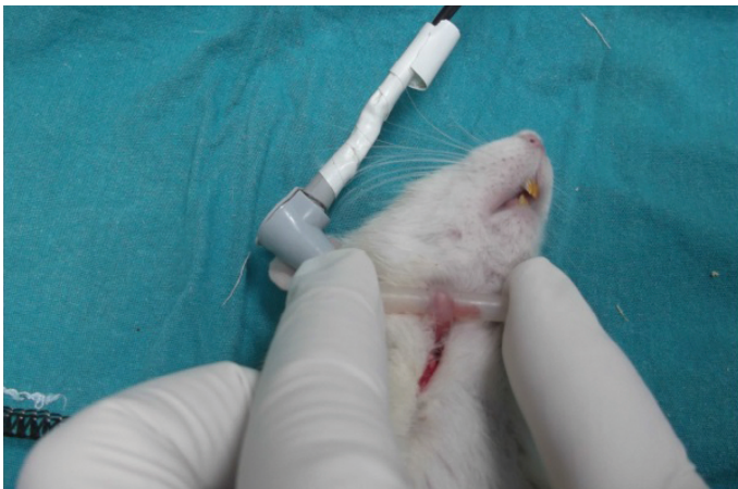
FIGURE 3. DPOAE Measurement during hypoxia.

All surgical procedures were performed in a sterile environment and with sterile surgical instruments. Trachea was reached by dissecting tissues at the midline of the neck after a 1.5 cm incision in the vertical plane and an appropriately sized cannula was placed through the window opening in the trachea (Fig. 1, 2).