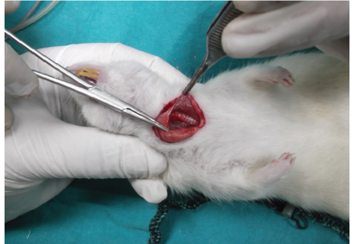
FIGURE 1. Tracheotomy incision.