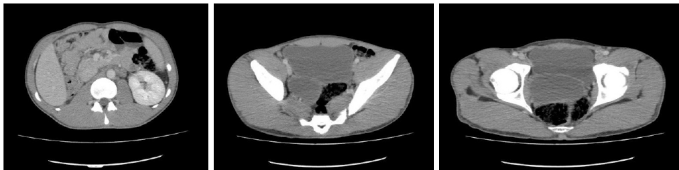
Figure 1. Vesicle cyst on abdominal tomography.

els (45 mg/dL, reference range 0–5). Liver enzymes ALT and AST were found to be slightly elevated (80 mg/dL and 85 mg/dL, respectively). Viral hepatitis panel and hydatid cyst serology were negative. Abdominal ultrasonography revealed the absence of the right kidney and a dense cystic mass in the posterior of the bladder. Abdominal tomography was performed on the patient. The tomography confirmed agenesis of the right kidney and identified a cystic mass measuring 7.5×7.5×10 cm in diameter, extending from the posterior of the bladder to the central zone of the prostate (Fig. 1). The patient's fever (38.4°C) persisted, and the abdominal pain worsened, leading to surgical intervention. The complicated seminal vesicle cyst located in the posterior of the bladder was opened laparoscopically. After the cyst was opened, a large amount of purulent ejaculate fluid was aspirated from its content (Fig. 2 and Video 1). Subsequently, the cystic mass was completely removed (Fig. 3 and Video 1). The patient had a urinary catheter removed on the 1 st