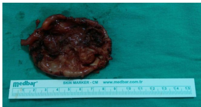
Figure 3. Image of cyst after excision.

day, the drain was removed on the 2 nd day, and he was discharged on the 3 rd post-operative day. A month later, liver enzymes were observed to have returned to normal. The patient did not experience any abdominal pain or genitourinary symptoms after the operation.