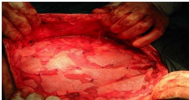
Picture 3: Modified Dick Repair: Placement and fixation of the polypropylene mesh