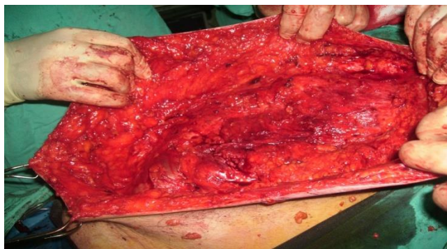
Picture 1: Modified Dick Repair: Removal of the old incision scar and dissection up to intact fascia

Modified Dick Technique: This technique is a modification of the original Dick method. In this method tension-free repair is aimed by using a polypropylene mesh instead of the sutures that are placed for repair in the original Dick technique. In the operation, a skin incision is made according to the size of the hernia and excessive skin is removed. The subcutaneous adipose tissue should be dissected at least 3 cm distant from the defect margins until an intact fascia is seen (Picture 1).