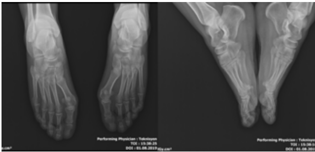
Figure 1 Preoperative radiographic images of a 33-year-old male patient with HV treated with cannulated screws.