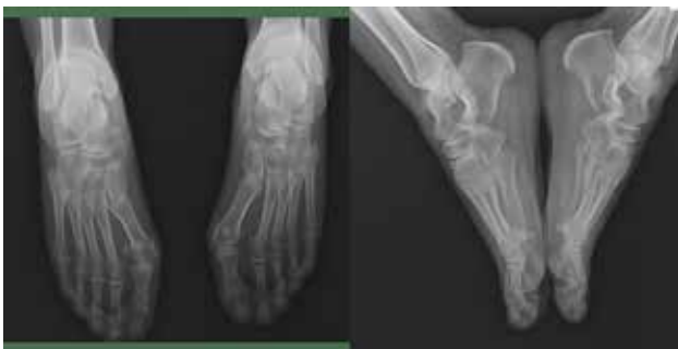
Figure 3 Preoperative radiographic images of a 22-year-old female patient with hallux valgus treated with Kirschner wires.