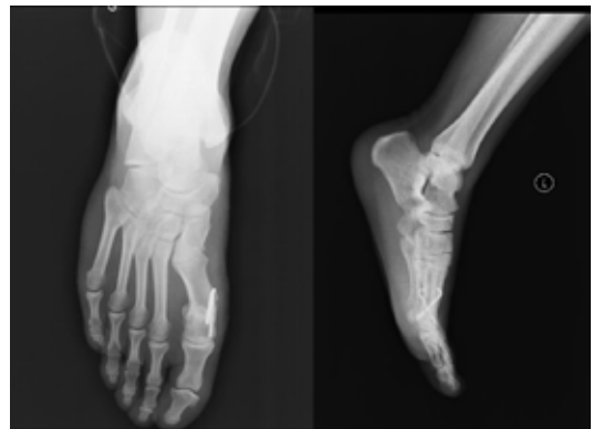
Figure 4 Postoperative radiographic images of a 22-year-old female patient with hallux valgus treated with Kirschner wires.