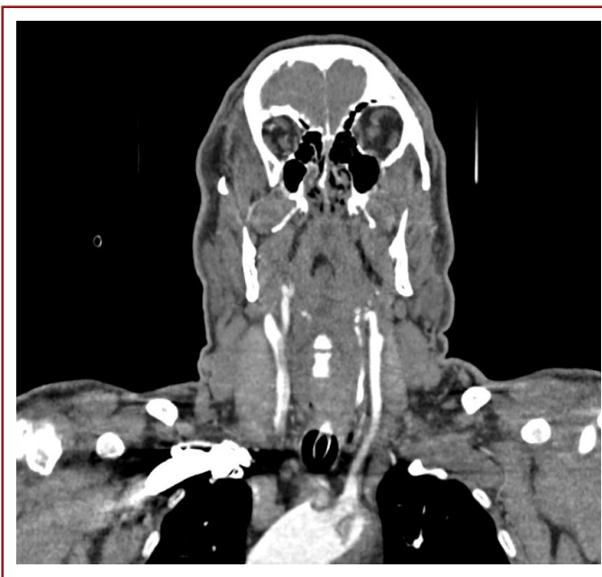
Figure 3. Dissection in the right common carotid artery (CCA) and blockage of the left CCA and brachiocephalic trunk with thrombus.

Because of the severe cerebral infarction and poor general condition, the cardiovascular surgeon recommended hospitalization in an intensive care unit (ICU) until his condition stabilized. He was treated conservatively in the ICU and died 2 days after the onset of illness.