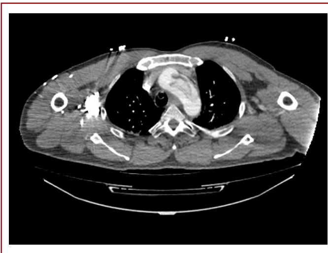
Figure 2. Dissection in arcus aorta.