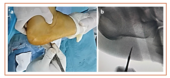
Figure 2. Release of the plantar fascia (a) and checking depth with a scalpel (b).