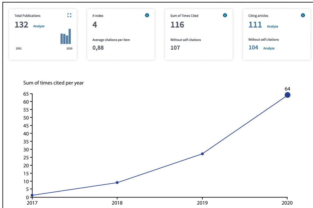
Figure 2. European Endodontic Journal citation report (Web of Science, accessed Mar 25, 2021)