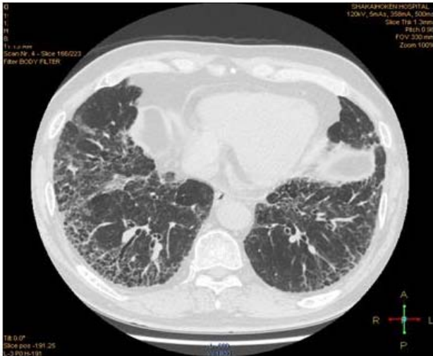
Fig. 2a. Chest high resolution (HR) CT showed exacerbated reticular opacities in the right middle and left lower lobes accompanied by honeycombing on this episode of dyspnea.