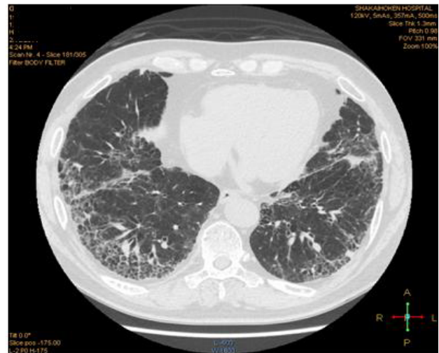
Fig. 2b. Chest HRCT showed considerably improved reticular opacities accompanied by honeycombing 6 months after CAM treatment.

CAM stopped lung function decline with no change in chest CT. But, in our present case, reticular opacities on chest CT and chest HRCT improved considerably. The difference in improvement on CT findings between two cases might be related to prescribed CAM dosage.