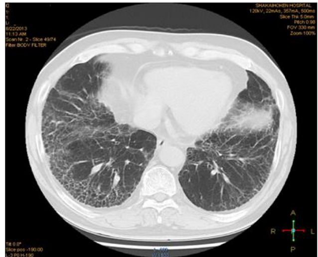
Fig. 1b. Chest CT showed exacerbated reticular opacities in the right middle and left lower lobes accompanied by honeycombing on this episode of dyspnea.