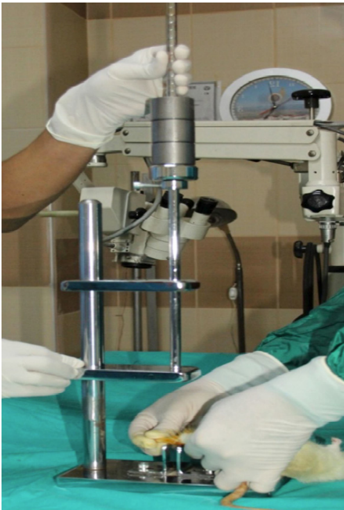
Figure 2. Fracture following the three-point principle after intramedullary fixation of the tibia.