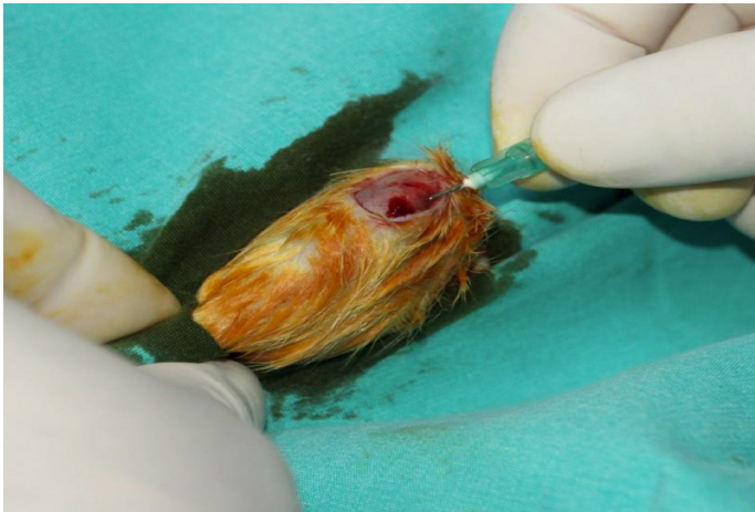
Figure 1. Tibia fixation using a 0.7 mm needle.