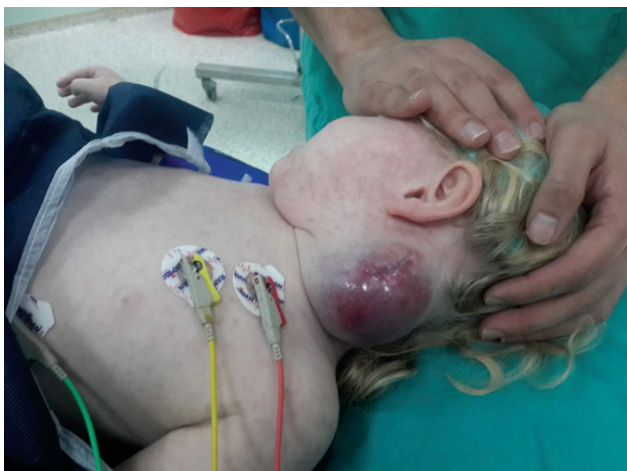
Figure 1. Left neck mass of a 3-year-old girl.