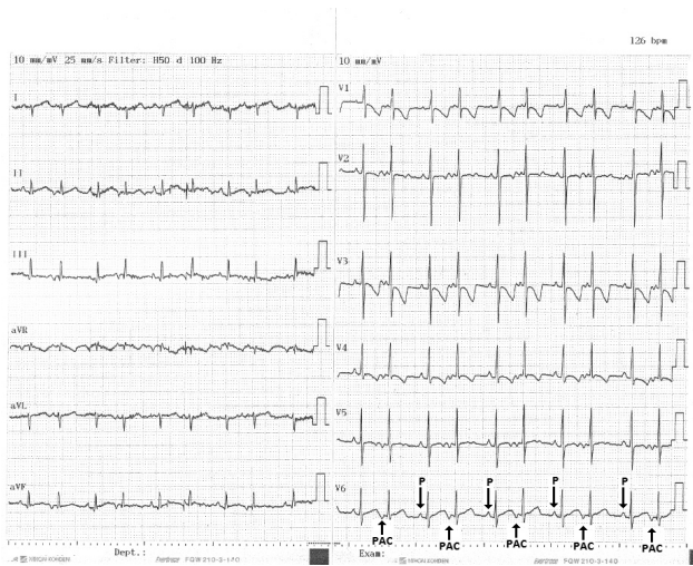
Figure 2. Antiarrhythmic medication was started with Propafenone. On follow-up 12-lead electrocardiogram, all of the PACs conducted. P, P wave; PAC, premature atrial contraction.

ed. On follow-up Holter monitor recordings, the prevalence of premature beats decreased and the mean heart rate increased to 128 bpm. All of the PACs were monitored on ECG (Figure 2). Premature beats were not observed on the ECG obtained 2 months after discharge and normal sinus rhythm was restored.