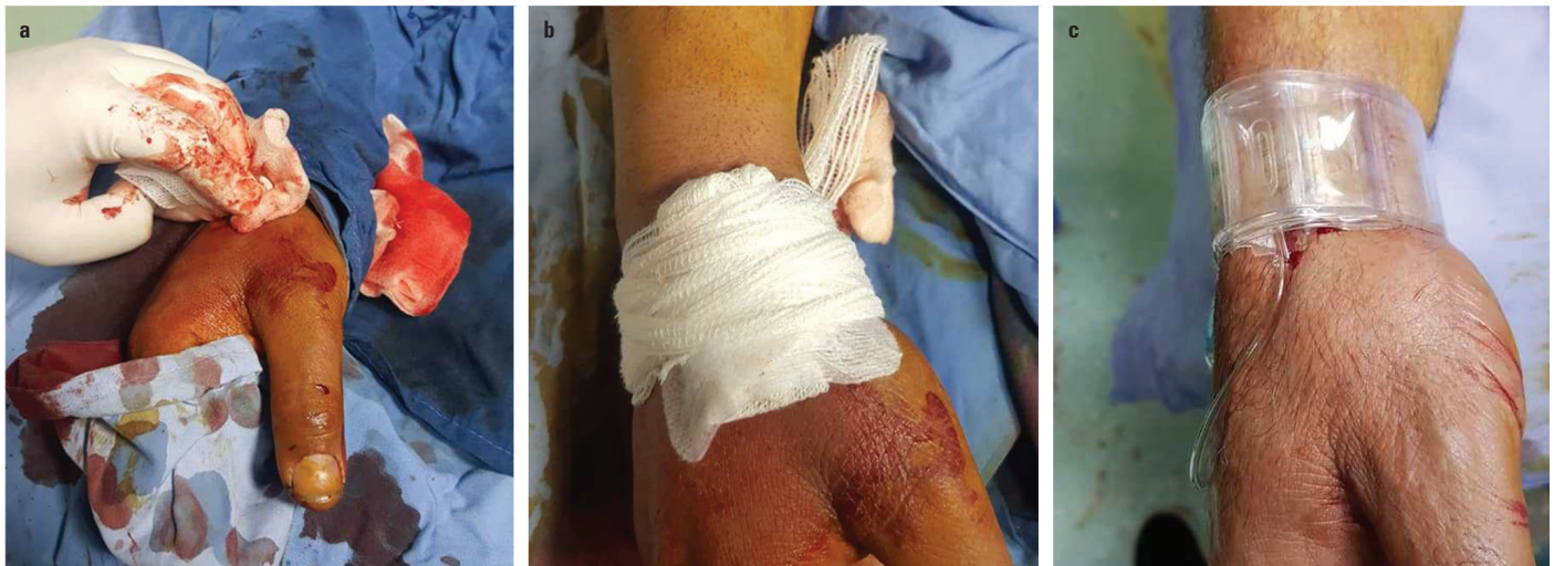
Figure 2. Hemostasis methods in trans-snuffbox access: manual compression (a, b) and mechanical compression by TR band (c).

bandage pack on the puncture site was placed, which remained for 1–2 hours (Fig. 2a, 2b). In mechanical compression approach a TR band device (manufactured by Lepu Medical Technology Co. Beijing, China) was applied, which was filled with 10–15 cc of air on the balloon, concurrently removing the sheath. Then, the bladder was decompressed to reduce the compression pressure until blood oozed, ensuring radial artery blood flow (patency), and again the device was reinflated with 1–2 cc of air to allow homeostasis. Every after 20 minutes and every 5–10-minute intervals, the wrist bracelet air was reduced to evaluate primary hemostasis. When the primary hemostasis was achieved, the TR band was inflated again with at least 10 cc of air and reduced gradually, 2 cc every 10 minutes (Fig. 2c).