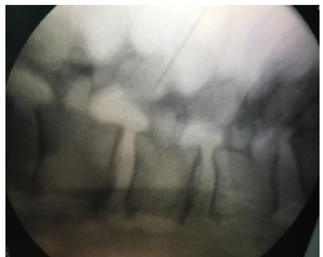
Figure 3. The lateral view shows electrode positioned of the third lumbar medial branch at the L4 transverse process.