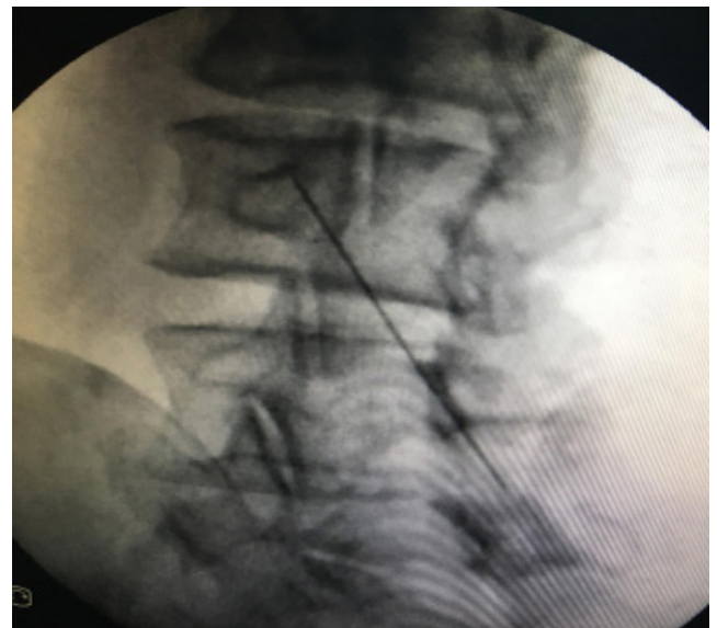
Figure 2. The oblique view shows electrode positioned of the third lumbar medial branch at the L4 transverse process.