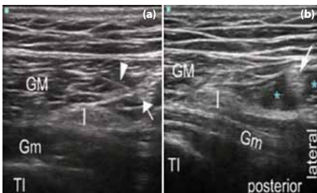
Figure 5. Gluteus maximus (GM) medius (Gm) muscle, ischiadic (I) and posterior cutaneous (arrow) nerve, ischial tuberosity (TI), needle (arrow head), local anesthetic (*). (a) Posterior cutaneous nerve is shown at the lateral side of the ischiadic nerve and under the lateral board of the gluteus maximus muscle. The needle is placed near the medial side of the posterior cutaneous nerve. (b) The local anesthetic is deposited mostly around the posterior cutaneous nerve but only a small part of the local anesthetic is in contact with the ischiadic nerve.

the back surface of the thigh and leg. It is principally a sensory nerve. [1,2] It can be defined as a cutaneous nerve. It accompanies the inferior gluteal artery to the gluteus maximus and runs down the outer thigh and deep into the tissue at the back of the knee. [5] PFCN is not a branch of sciatic nerve; it is a separate branch of sacral plexus. However, PFCN arises from greater sciatic foramen with sciatic nerve and goes to subgluteal field together with it. Thus, while a sciatic nerve block is implemented with posterior approaches (such as Labat approach), PFCN block can also be obtained.