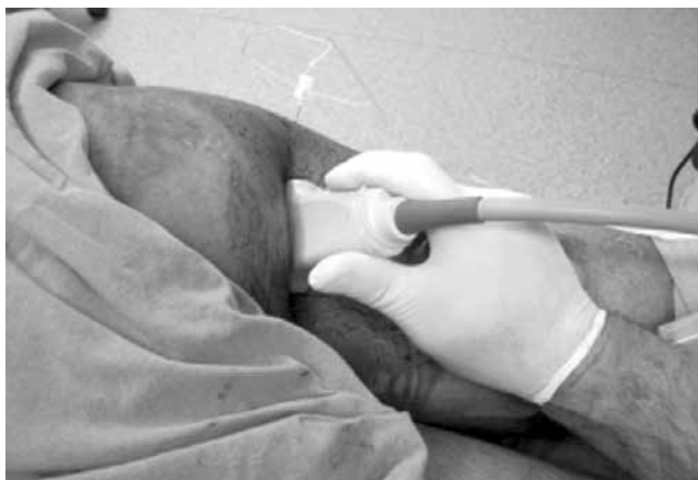
Figure 4. There is a scar tissue at the gluteal region (arrow). The patient is prone position and the probe is placed parallel to subgluteal crease. In-plane approach for posterior cutaneous nerve blockade.