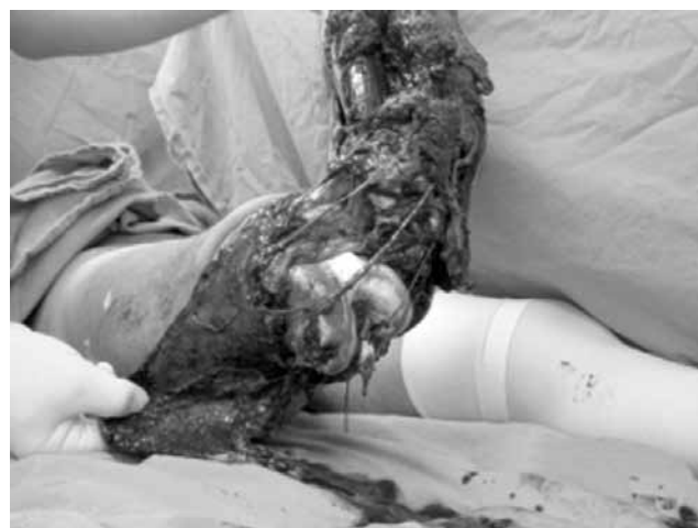
Figure 2. Subtotal amputation of the distal thigh due to trauma before the operation.

PFCN is distributed to the skin of the perineum and