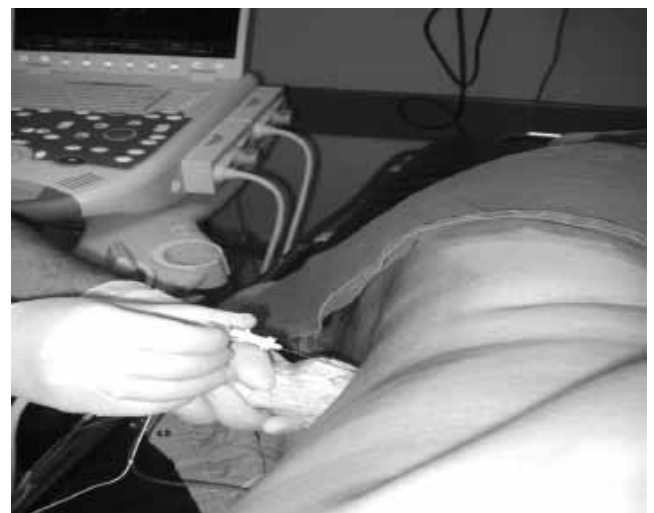
Figure 1. A low frequency curvilinear ultrasound probe was placed at the level of L4-5 in the transverse plane while the patient is placed in the right lateral decubitus position.

On arrival to the holding area where blocks were performed, standard monitoring (pulse-oxymetry, heart rate (HR), noninvasive blood pressure (NIBP) and ECG) was applied. A 20-gauge intravenous (IV) cannula was placed on the right hand of the patient and a free running infusion of saline was started. Oxygen 2 L/h was applied via mask. Sedation was provided with 3 mg IV midazolam after the lateral decubitus position with the left operative side up, the hips and the knees flexed. After disinfection and sterile draping, sterile gel was applied to the procedure area. A low frequency curvilinear ultrasound probe (1-8 MHz, Esaote My Lab 30, Genoa, Italy) was placed at the level of L4-5 in the transverse plane (Figure 1). Vertebral body, articular process, psoas, erector spina, and quadratus lumborum muscles were visualized (Figure 2). After LA skin infiltration, a 22-gauge 100 mm insulated needle (Pajunk, Geisingen, Germany) was inserted lateral to the probe, using in-plane technique. The correct tip position was confirmed with quadriceps contraction at 8 cm by neurostimulator 0.5 mA. Then, LA mixture of 30 mL (10 mL 2% lidocaine and 20 mL 5% levobupivacaine) was injected incrementally in fractionated doses with frequent aspiration to detect any possible intravascular puncture. The LA spread was observed on transverse axis scan.