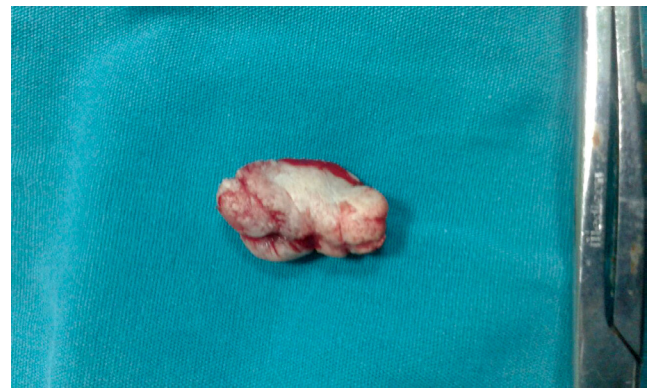
Figure 3. Post-operative picture of the mass.

Osteomas are benign, slowly growing, well-limited tumours of the paranasal sinuses. They are primarily observed in the frontal sinuses, followed by the