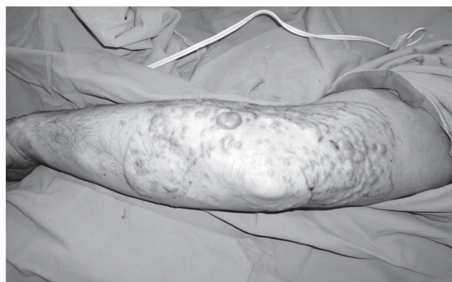
Figure 1. Multiple cutaneous leiomyomas on the left arm.

After standard monitoring was applied (electrocardiogram, pulse oximetry, and noninvasive blood pressure) the patient was sedated with iv midazolam 2 mg and fentanyl 100 mcg.