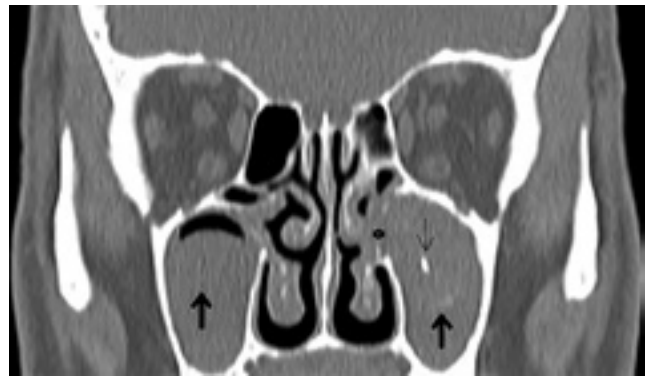
Figure 2. Case 2. Preoperative coronal CT section . Thin black arrow showing metal dense focus and thick black arrows showing microcalcifications. Asterisk showing enlarged sinus ostium and protruding fungus material into the nasal cavity.

Case 2 – A 55-year-old immunocompetent male patient; presented with bilateral face pain, intermittent headache, nasal congestion and post nasal dripping. The patient had a history of ESS. Nasal endoscopy showed edema at both sides of ostiomeatal complex and purulent postnasal drip at the left side. CT scan showed total opacification on left maxillary sinus and partial opacification on right maxillary sinus. Calcifications had seen particularly on central part of left maxillary sinus, dense metal foci were present on left maxillary sinus. CT scan also showed bilateral en-