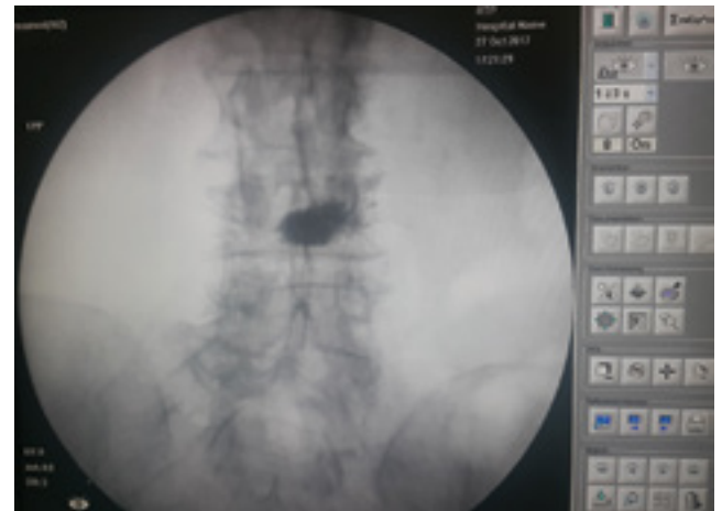
Figure 2. Radiological examination of the approach.

complication rates. [2,3] Lange et al. found that after a 5-year follow-up of patients with osteoporotic vertebral fractures, mortality risk was much higher in medically treated patients compared to the pa-